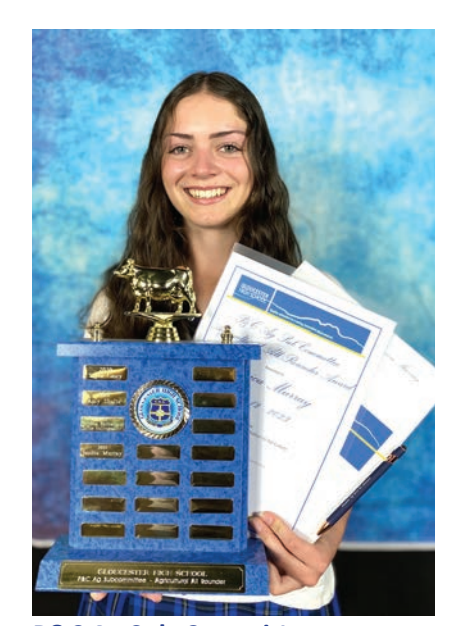
P&C Ag Sub-Committee Agricultutal All Rounder Award