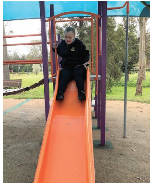
The MC Class

On Monday 19 September the Multi-Categorical (MC) students met up with new friends from Taree High School. We met up at Billabong Park, we had fun getting to know each other and we enjoyed a picnic together. We can't wait until we travel over to Taree to meet up again next term.