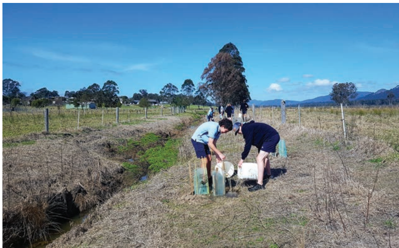
Watering trees in our koala corridor