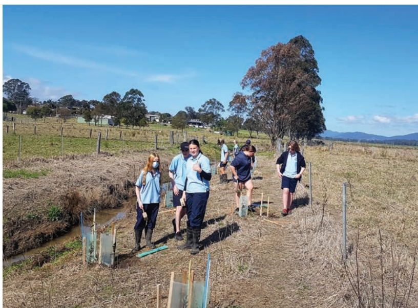
Protecting trees in our koala corridor