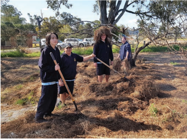
Mulching the orchard