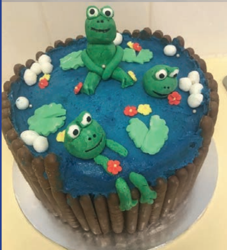
Year 9 Food Tech Birthday Cakes