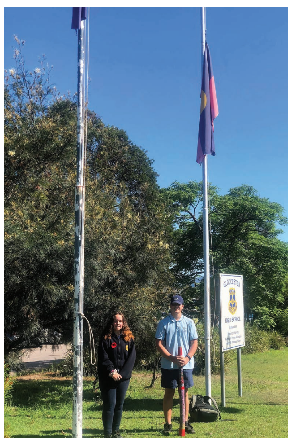
FLAG RAISING DURING NAIDOC WEEK