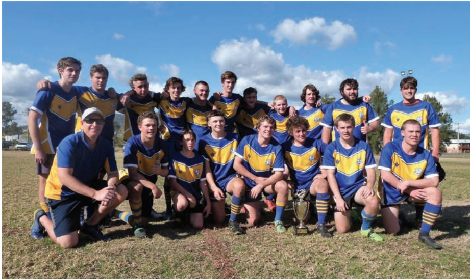
Open Boys Rugby League team with the Chris Hoare Cup