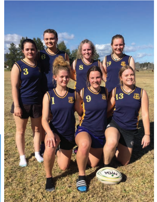
Open Girls Touch Football team

Girls Netball – Gloucester Y10 girls 41 defeated Gloucester Y8 Girls 27