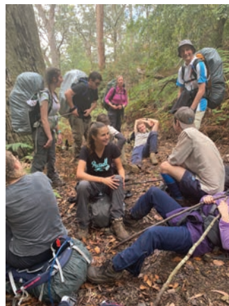
A well earned break

Fortunately, the storm calmed and the wind dropped and as night fell it started to gently rain.