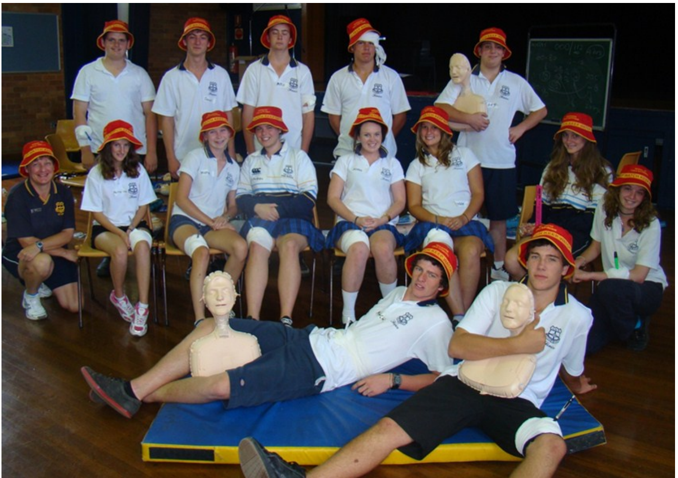
Wearing our R.L.S.S.A. pool safety 'Keep Watch Designated Child Supervisor' hats

The group also learned that there are two emergency contact numbers: 000 or 112 (mobile phones).