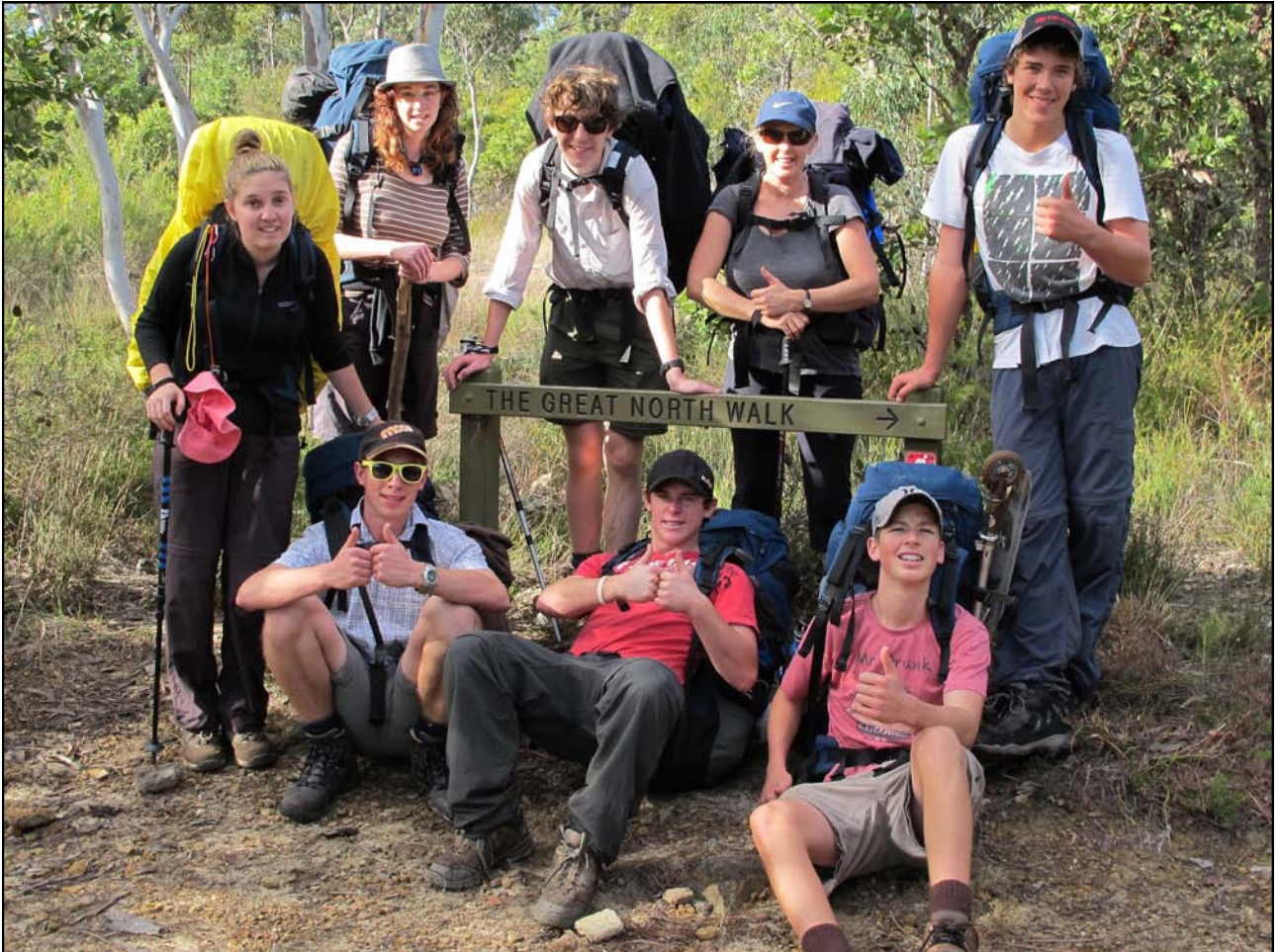
The Whole Group at the start of the trip.