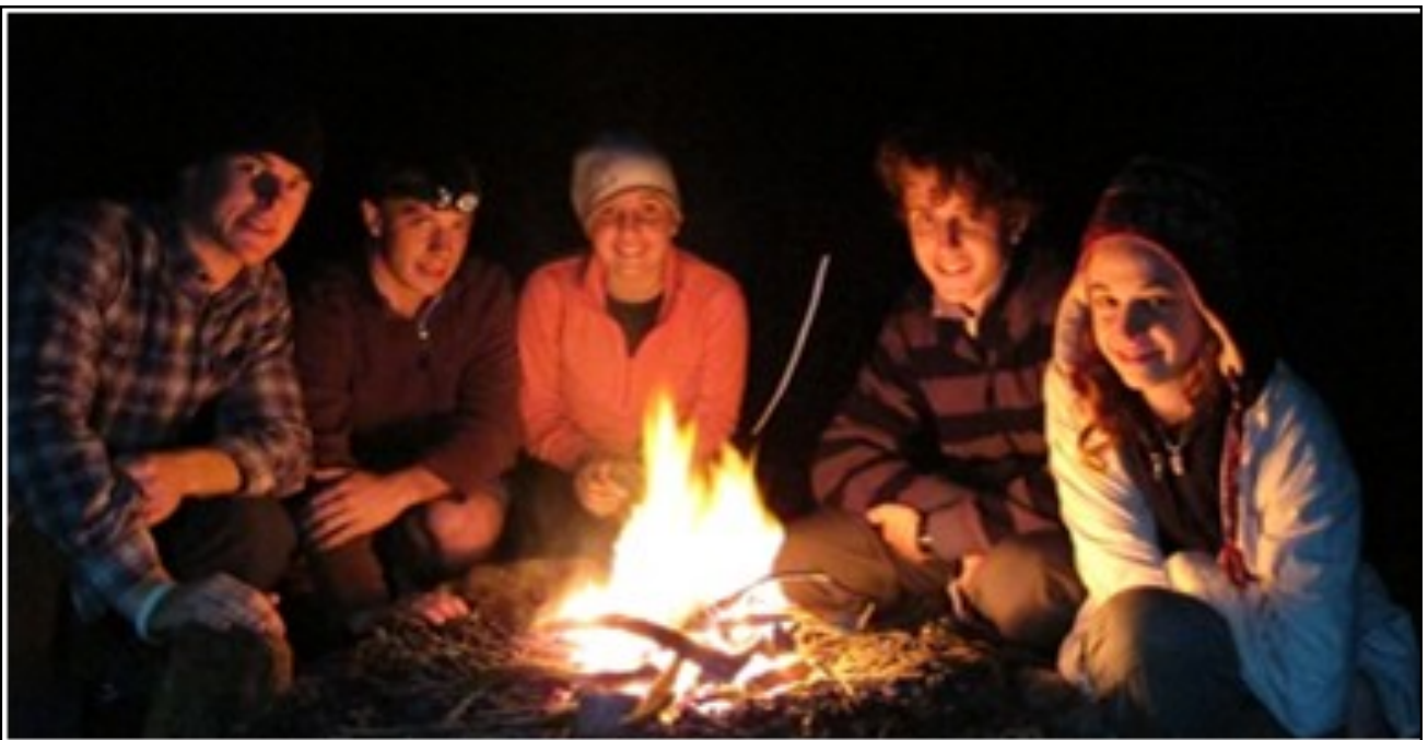
Around the campfire on the first night.