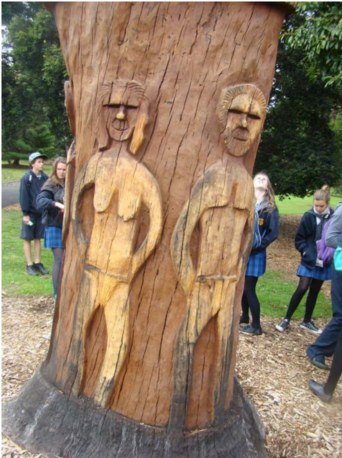
A modern, symbolic tree carving on the oldest tree in the Gardens

A brisk walk took us to the Art Gallery NSW where we were split into three groups. Our enthusiastic guides introduced us to a selection of artworks in the Aboriginal and Torres Strait Islander exhibition. The guides were keen to involve us and asked lots of questions, such as what we thought the artists were trying to tell us through their designs. The Art Gallery has an amazing collection of Indigenous works and many students would have liked extra time to browse at their leisure,