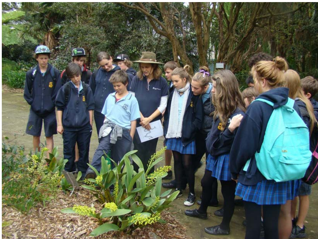
Aboriginal bush foods abound