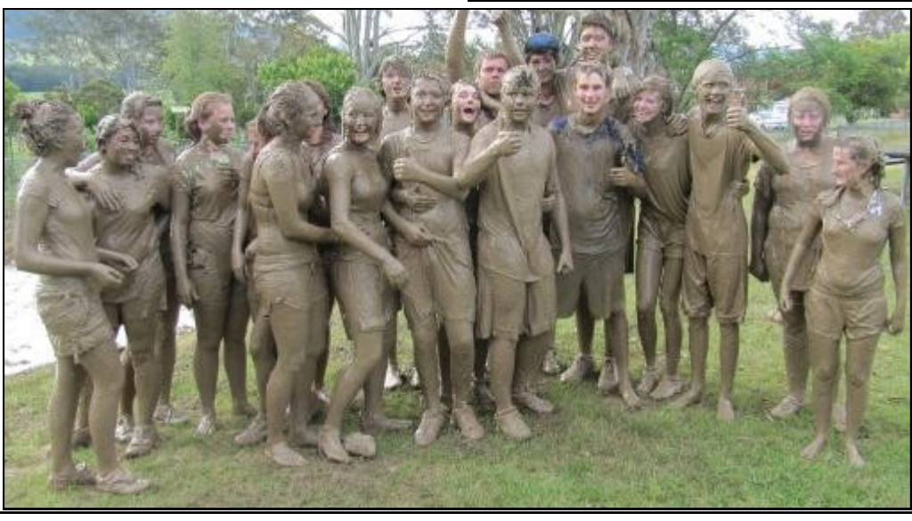
Care, Achievement, Respect, Effort, Responsibility